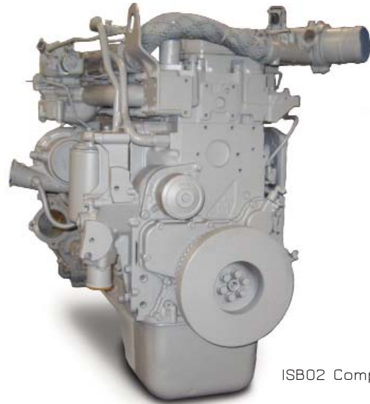
ISB02 Complete Drop-

All of NPD's Complete Drop-In engines are 100% dyno tested prior to shipment. Computer controls ensure that each engine dyno test is conducted under standard, repeatable settings. Every engine is run through a warm up cycle; three separate cruise segments simulating light, medium and heavy throttle conditions; maximum torque and horsepower tests; both high and low idle tests; and a black light leak detection test with dyed oil, coolant and fuel.